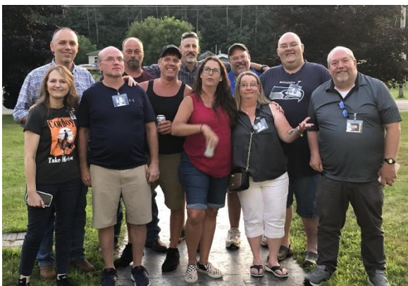
Below right: The Class of 1983 held their very first reunion at Half-Shire on the day of the 80s reunion. 11 of the 13 members present are pictured here.