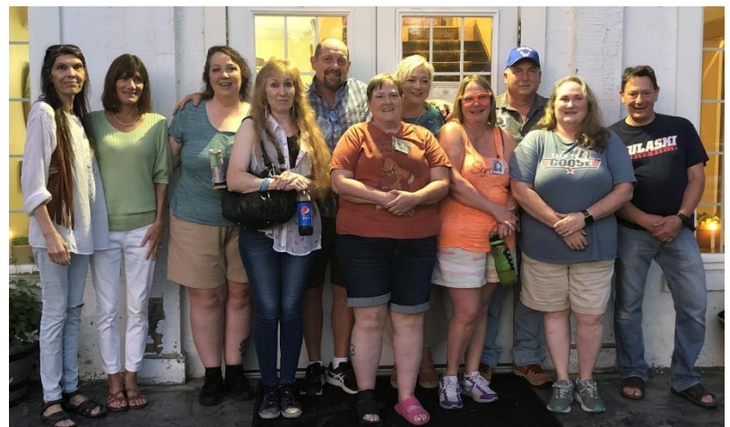
Left- The class of 1988 also held their 35 th reunion at the 80s reunion at Half-Shire. Eleven members were present.