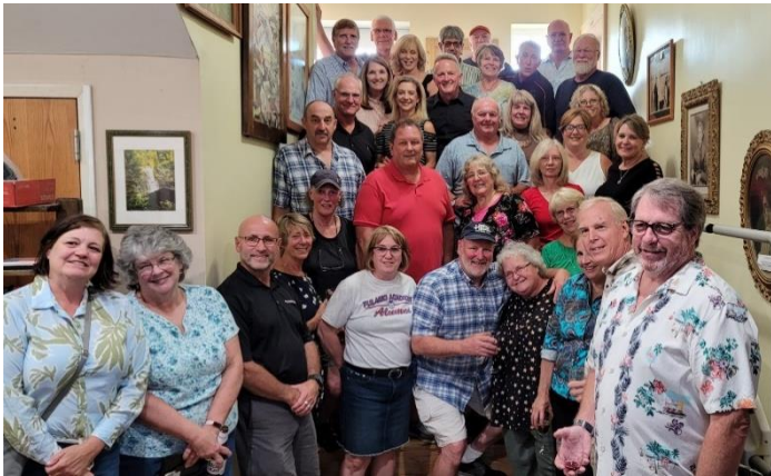
Left-The class of 1978 gathered in Richland to mark their 45 th reunion on July 15 th . A good number of class members and spouses were present!